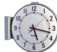
12" Analog Clocks