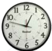
13" Analog Clocks