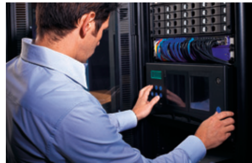
Designed for easy installation and simple integration into your existing communication and safety systems.